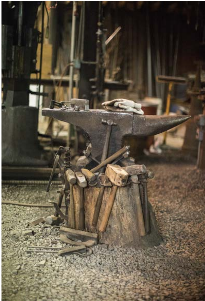
Hammers and tongs, the essential tools for the essential craft.

There's a very good chance you already have many of the tools you'll need to get started in blacksmithing, such as hammers, a vise, and vise grips. For any tools you do need to purchase, there are many inexpensive options on the market. You can score yourself an even better deal (and have a bit of fun) by hunting at garage and estate sales or on eBay.