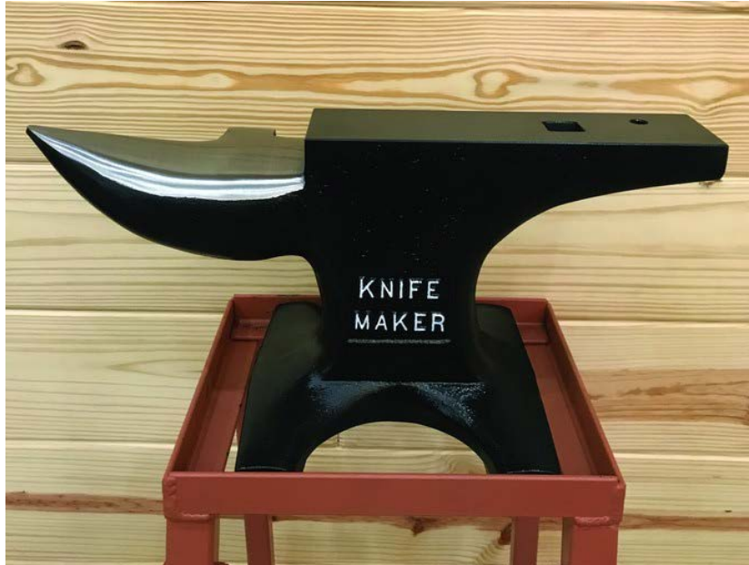
NC's 76-pound Knife Maker anvil is a great option at $310.

There are a lot of great new anvils on the market, too. The 76-pound Knife Maker anvil at $310 is an excellent choice. For those with a higher budget, below I've also included a list of other new anvils ranging from $400 to just over $1000.