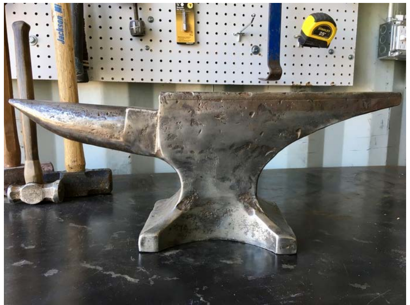
This anvil was purchased for less than $250 by setting an alert on craigslist and then acting quickly once it was posted.