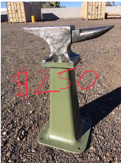
An 80lb anvil and stand I just bought on craigslist for $250. A very nice setup for any blacksmith, including a beginner.

A high-quality 75-100 pound used anvil offers you the best overall value as a novice blacksmith. You can usually find one quickly for around $5 per pound. If you are patient, you can even find one for $1-$3 per pound. This means that you can pick up a used 75-pound anvil for between $200 and $500. Ebay tends to have the highest prices, while your best bet for scoring a deal is craigslist, OfferUp, or most of all, word of mouth.